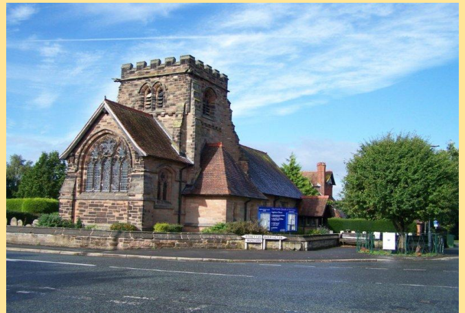
St Cross, Appleton Thorn