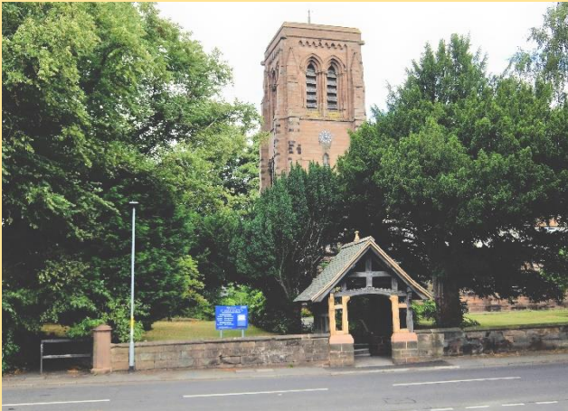
St Matthew's, Stretton